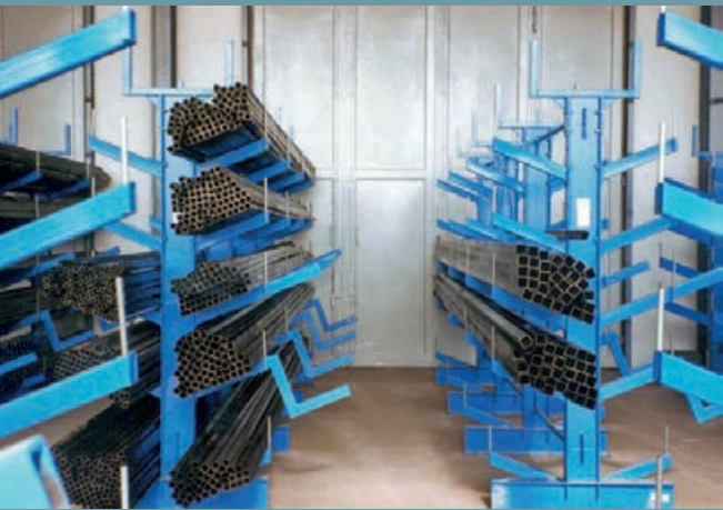
Cantilever racks with inclined arms for storage with a crane. Handling using order picking or storage locating attachment.