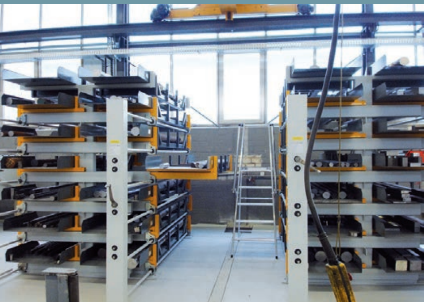
In telescopic cantilever racking whole storage levels are extended with a crank operated rotating spindles. Ideal for handling by means of a crane at minimal aisle width.