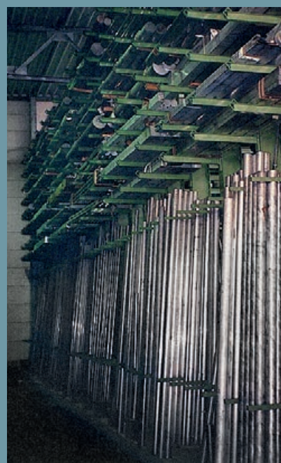
Vertical storage of tubes and bar stock directly at the workplace, sorted and easily accessible.