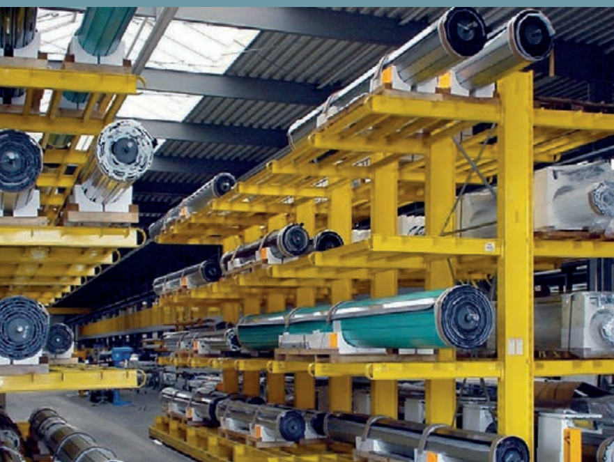
Roller Shutter reels, which have completed production in robust cantilever racking. Arm-bridges between arms for storage of varying dimensions.