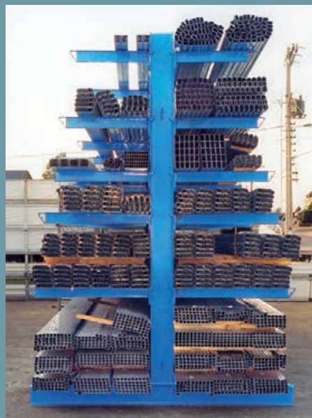
Fir tree racking - long materials racking with progressively shorter arms further up. Also available single-sided.