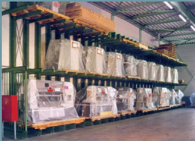
Ready-to-ship products are prepositioned in space-saving cantilever racking in the shipping area.